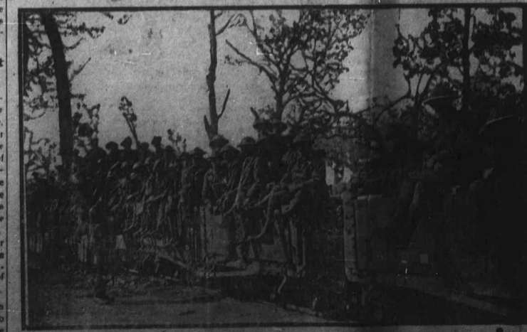
Wahg battalions being conveyed to the front.—They fought gallantly in the storming of Bonnois—gaining a line of their objectives.