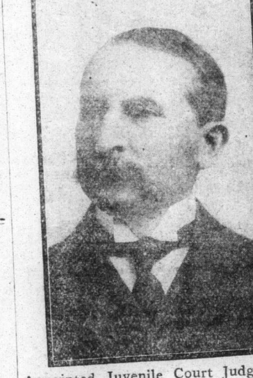
Appointed Juvenile Court Judge for Brant County by the Ontario

his usual health and on his return home expired suddenly from heart failure. He was born in Brant Co.