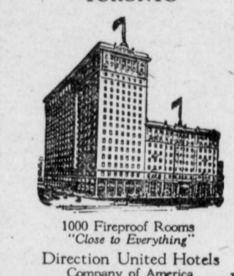
1000 Fireproof Rooms "Close to Everything" Direction United Hotels Company of America