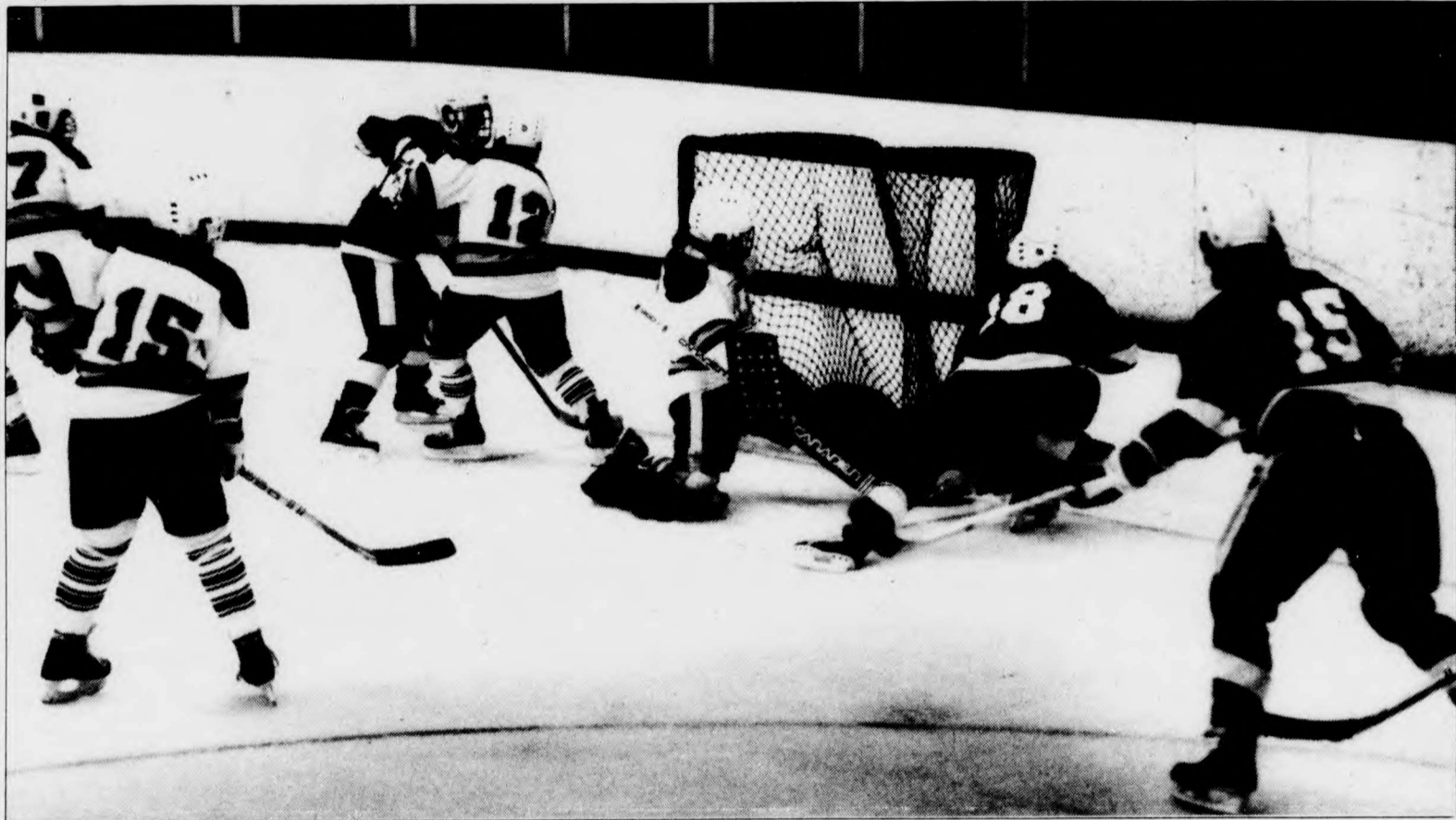
JAMMING IT IN: York's Debbie Maybury (No. 18) pokes the puck past McMaster goaltender Kathleen Topolseck. The powerplay goal put the Yeomen ahead to stay.

Two minutes later McMaster answered with two quick goals of their own, 37 seconds apart from