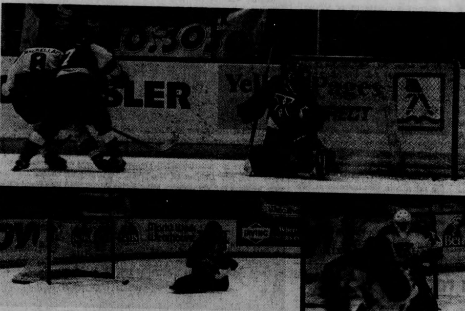
V-Reds get two by X and Carrol behind the pipes gets a good eye on the 3rd spot in the nation.

UNB wasn't motivated by the fact that St. FX was ranked nationally and UNB wasn't. "I don't put much stock in the national rankings." Rather the Reds were motivated by the belief that "St. FX is a very good hockey team. We think they are probably underrated. We