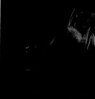
UNB wrestlers wrap up the competition.