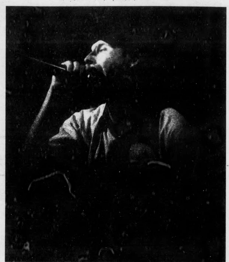
A beacon in the dark - Absolute Zero.