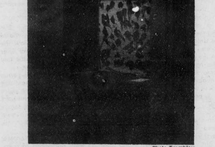
Another testimony that idiots indeed exist on this campus, this phone was ripped from the wall in the STUD.