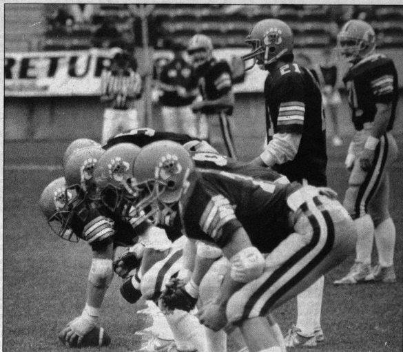
Bears offence lines up in last year's Shrine Bowl. The offensive line will be relied on again.

Brus is ready to handle the workload that is expected of him this