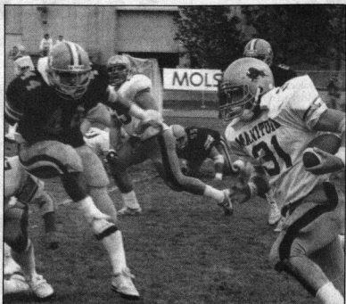
Unlike Manitoba, UBC couldn't move the ball against the Bear defence.

LATE HITS: The T-Bird win wraps up first place for them in the conference, and gives them the enviable privilege of hosting the WFL final, held on November 7th.