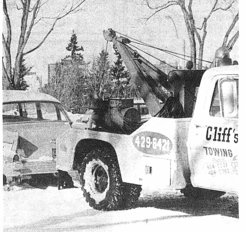
This sad scene is twice as sad as you may realize. As of March 22, Cliff's Towing is increasing its campus tow rates from $7.50 to $13.00 (plus a $2.00 storage charge "for each day or part thereof").