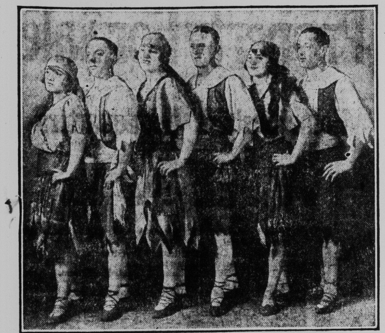
The world famous Teiganne Sextette, a sensational European novelty in music, song and whirlwind dancing, which will appear in the Opera House starting Tuesday afternoon.

Tomorrow afternoon a banner programme will be presented. It is said to be one of the best bills booked this season and will be as follows: The Teiganne Sextette, a sensational European troubadour novelty, introducing selections from grand opera, vocal solos and whirlwind and characteristic danc-