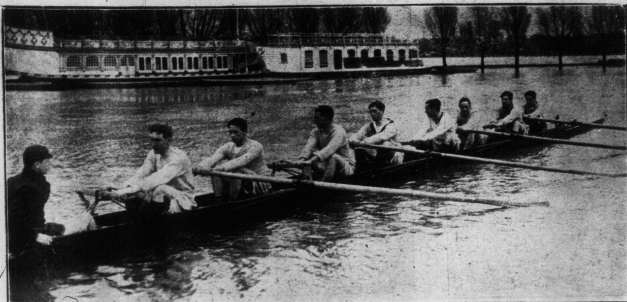
OXFORD UNIVERSITY BOAT RACE CREW AT PRACTICE. THE DARK BLUES COMMENCED PRACTICE JAN. 6.