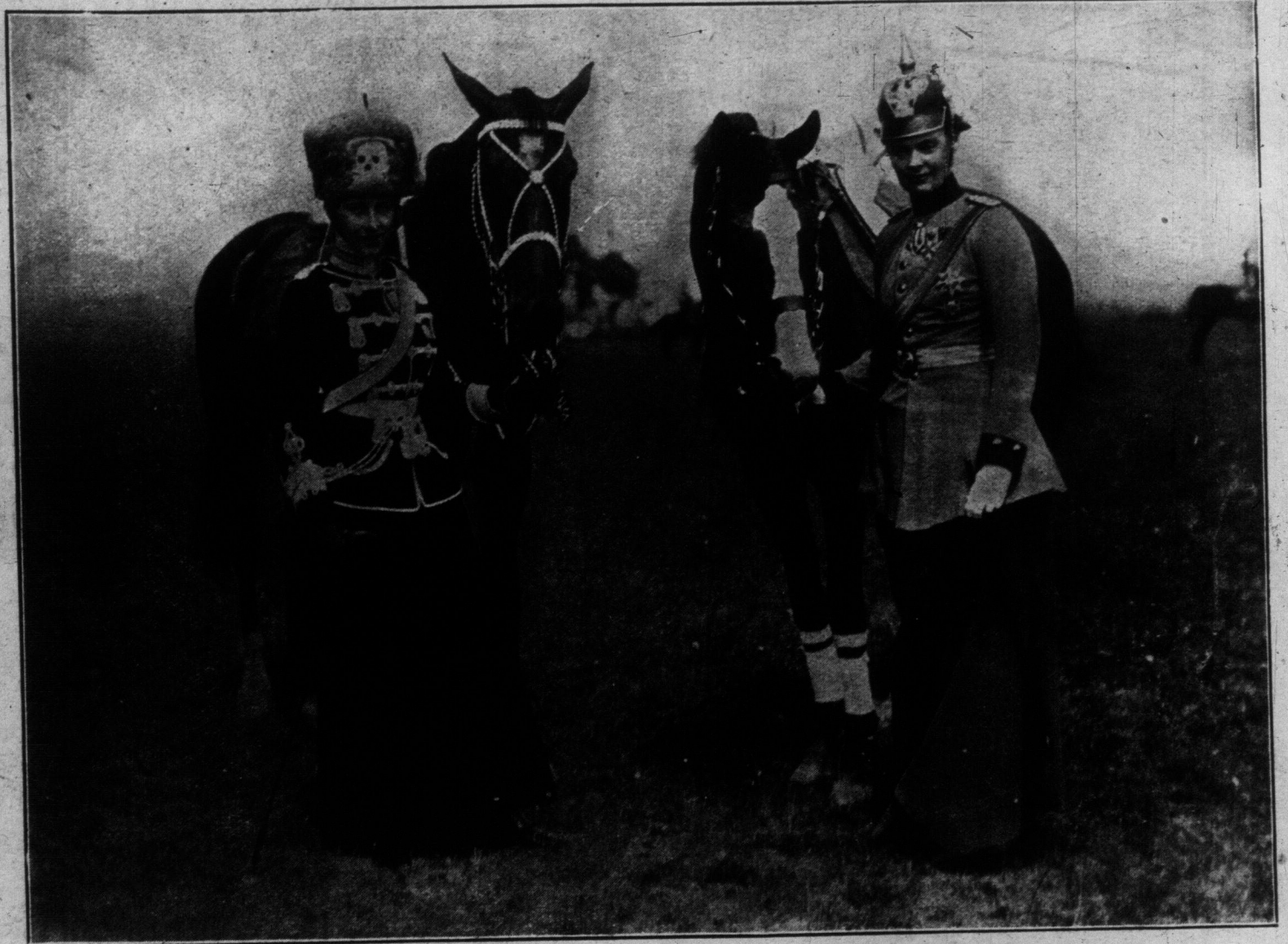
MILITARY SPIRIT IN GERMANY—CROWN PRINCESS CECILE, COLONEL OF KING FERDINAND III. DRAGOONS, AND PRINCESS VICTORIA LOUISE, COLONEL OF THE DEATH'S HEAD HUSSARS, IN THE UNIFORMS OF THEIR REGIMENTS.