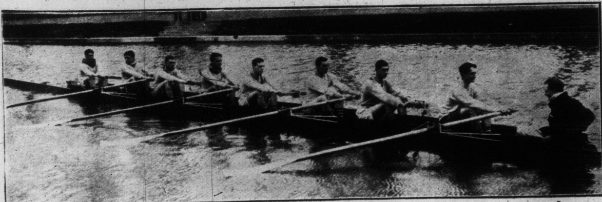
CAMBRIDGE CREW, WHICH HAS BEGUN PRACTICE FOR THE ANNUAL BOAT RACE WITH OXFORD.