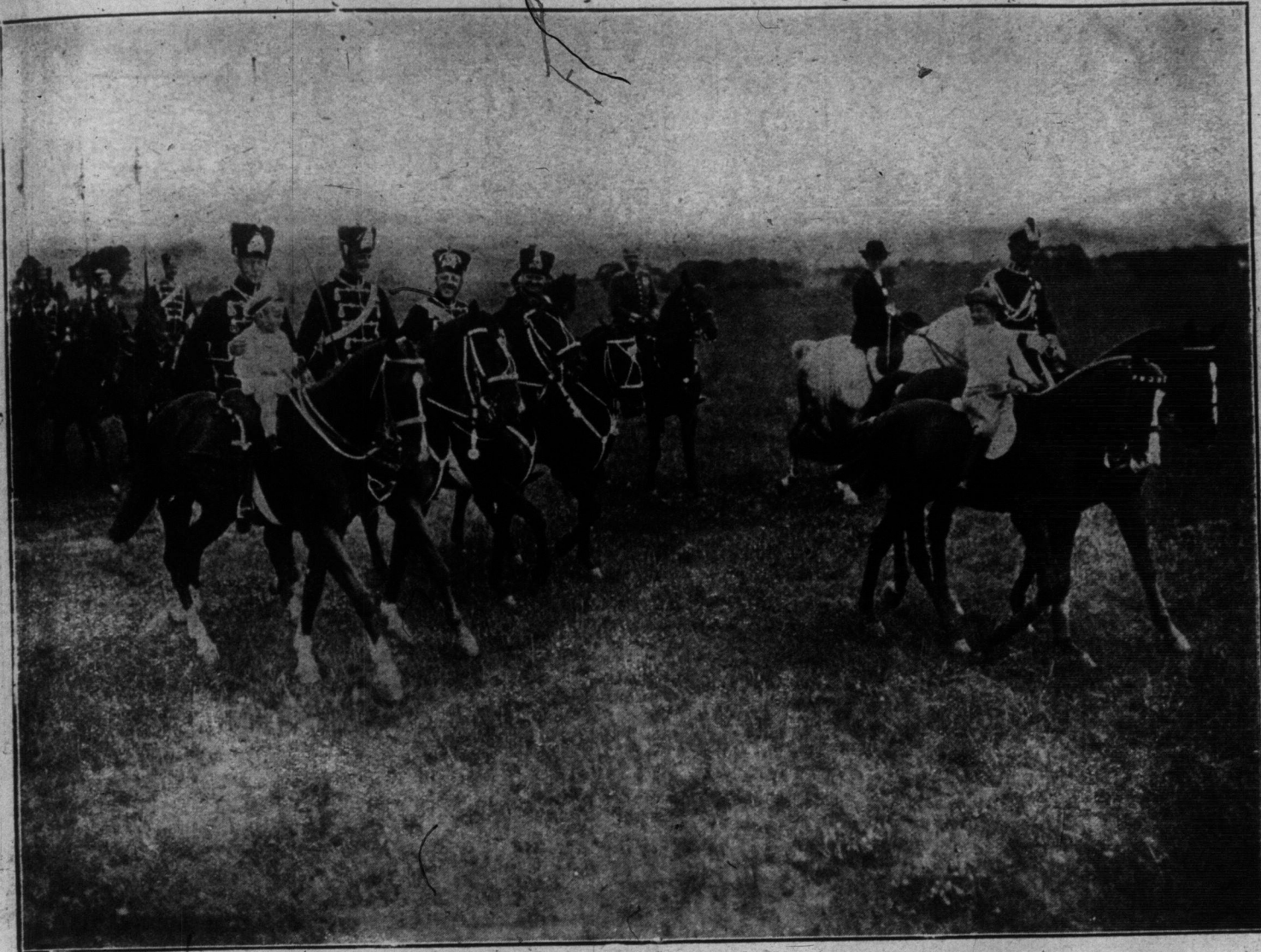
TEACHING THE YOUNG IDEA—GERMAN CROWN PRINCE WITH HIS SECOND SON, PRINCE LOUIS FERDINAND. AT THE HEAD OF THE REGIMENT IS HIS ELDEST SON, PRINCE WILHELM, ON A POLO PONY.