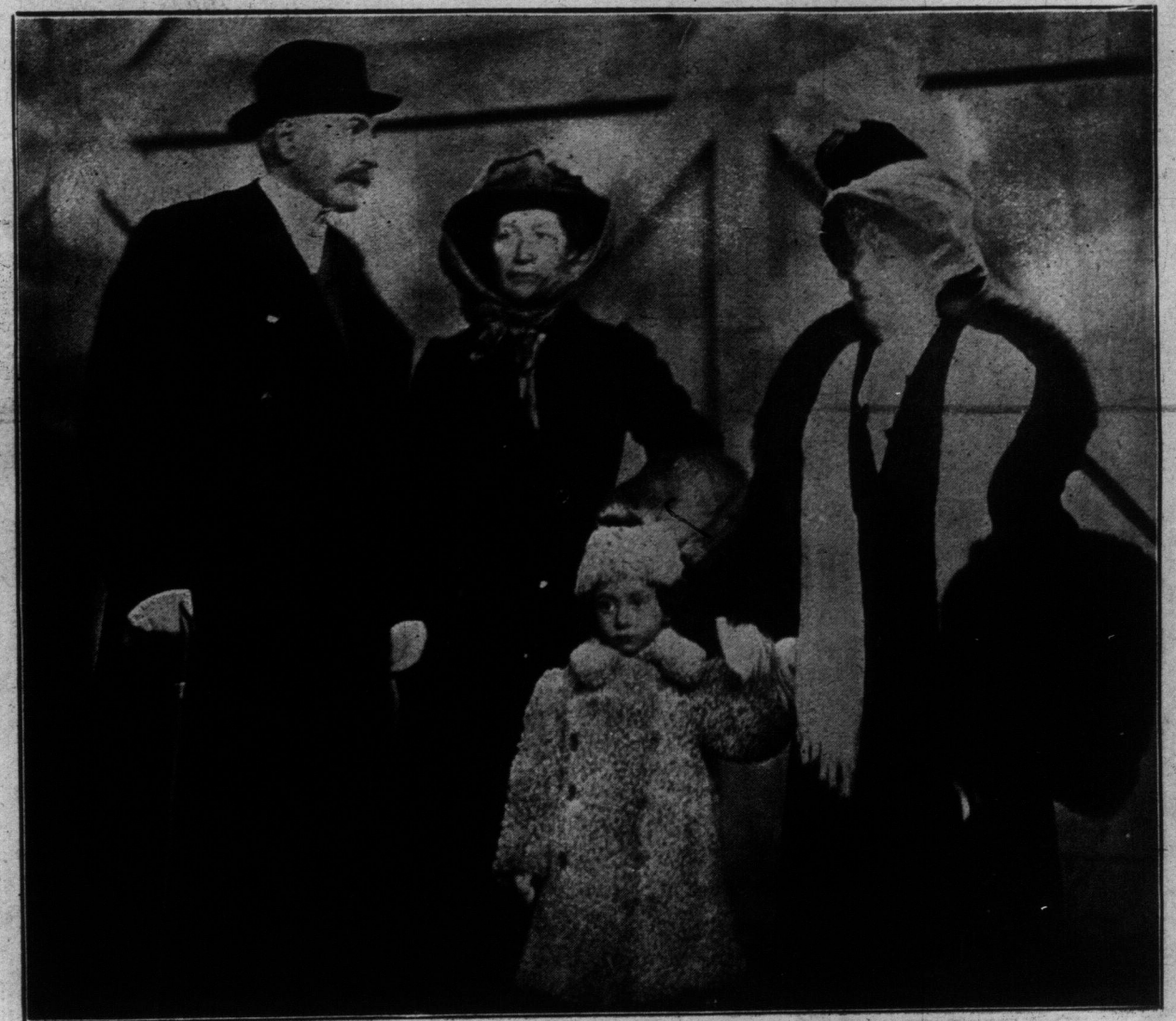
DUKE AND DUCHESS DE SAGAN AND THEIR BABY. THE DUCHESS WAS FORMERLY ANNA GOULD AND SHE CAME OVER THE OCEAN TO ATTEND THE WEDDING OF HER SISTER, MISS HELEN GOULD.