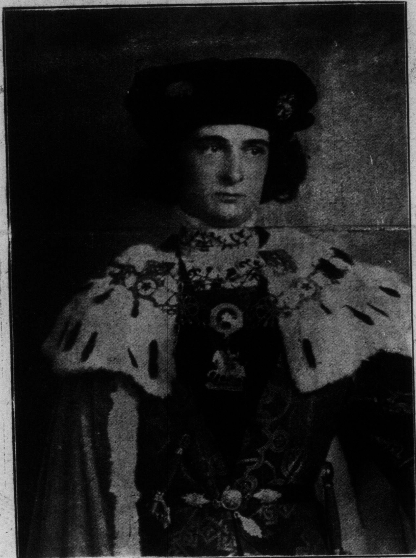
THE MARQUIS OF GRANBY, SON OF THE DUKE OF RUTLAND, WHOSE ENGAGEMENT TO LADY LEVESON-GOWER WILL SOON BE ANNOUNCED.