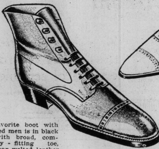
London brown is one of the new shades this spring and is proving very popular. This boot at $9.00 is of fine London brown calf with long recede toe with perforated toecap and Goodyear welted leather sole, low heel. Widths A to D. Sizes 5 1/2 to 11, $9.00.