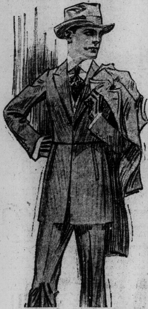
Illustrating the new split coat or waisted suit for the young man. It's of all-wool tweed or homespun in greenish grey, Cuban brown, chocolate brown, canard hair effects and steel grey with flake pattern. Cut in the two-button single or double-breasted waisted or veiled seam around waist style, with flare skirt, natural shoulders and deep vent. Trousers are straight cut and have cuffs. Sizes 34 to 40. Price, $25.00.