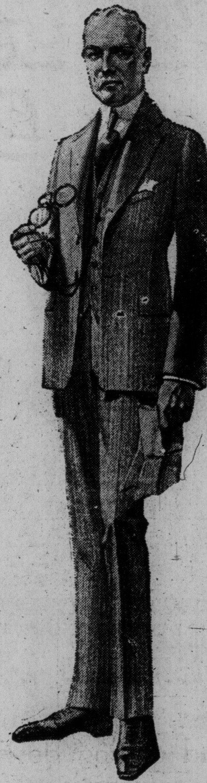
Illustrating a business man's $35.00 "EATON-made" blue worsted serge suit, in single-breasted, semi-form-fitting style, with vent at back. Shapely lapels and high-cut vests, trousers with or without cuffs. For young men, at the same price and of the same cloth, are suits in three-button, single-breasted, form-fitting style, with natural shoulders, high waist effect. Sizes 34 to 38. Price, $35.00. —Main Floor, Queen Street.