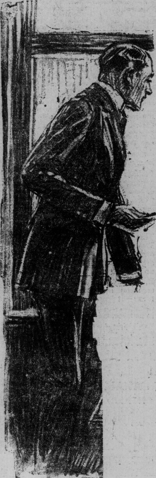
Illustrating a business man's suit of quality. In three-button, single-breasted sac style, of all-wool English worsted, in different patterns—one, a medium grey showing light thread stripes half-inch apart; another in dark grey, showing hairline stripes. Trousers plain or with cuffs. Sizes 36 to 44. Price, $42.50.

Hence This Page, Which Should Prove of Interest to Men, Young Men and Youths Who Have Tarried in the Buying of Their Easter Needs