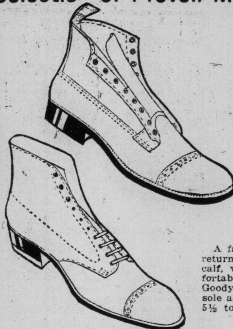
A favorite boot with returned men's in black calf, with broad, comfortably-fitting toe, Goodyear welted leather sole and low heel. Sizes 5 1/2 to 11. Pair, $6.50.