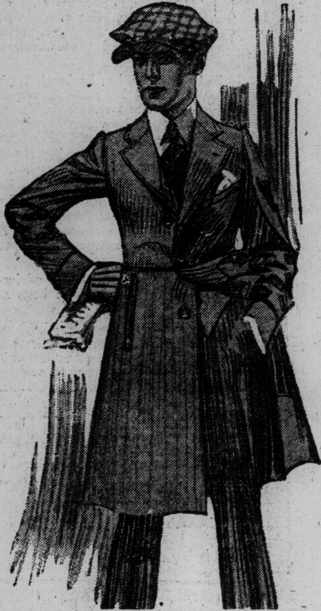
Illustrating a young man's topcoat, a waisted model of wool and cotton tweed or cheviot in plain green and grey or brown pin check patterns; in two-button, single-breasted, form-fitting waisted style, with slash and outside breast pockets, deep vent to waistline, flare skirt and durable body linings all through. Sizes 33 to 38. Price, $16.75.