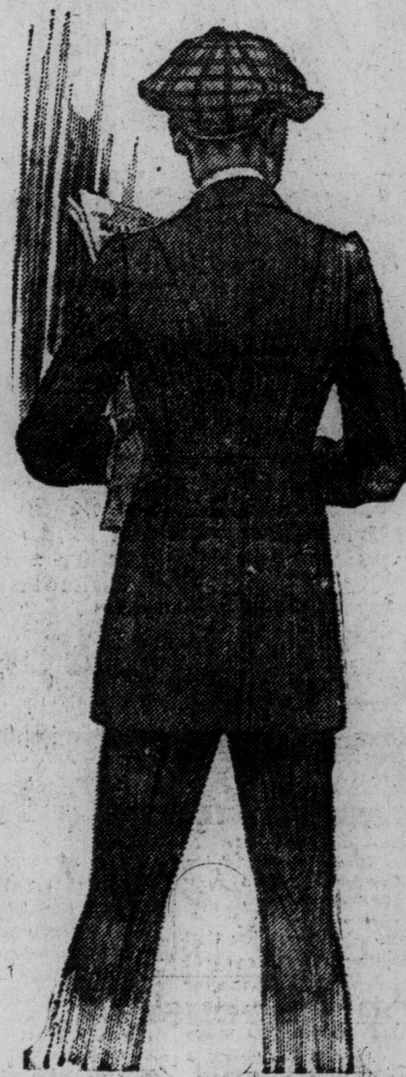
Illustrating a smart "first longer" suit in the waisted style with veiled all-around seam; of union soft finished cheviot, in rich browns or greys, and with soft roll-peak and notched lapels and slash pockets. Sizes 33 to 37. Price, $27.50. Another model is in the three-button, single-breasted, form-fitting all-around better style, and of a firm finished cotton and wool tweed in dark grey hairline stripes. Price, $15.00.