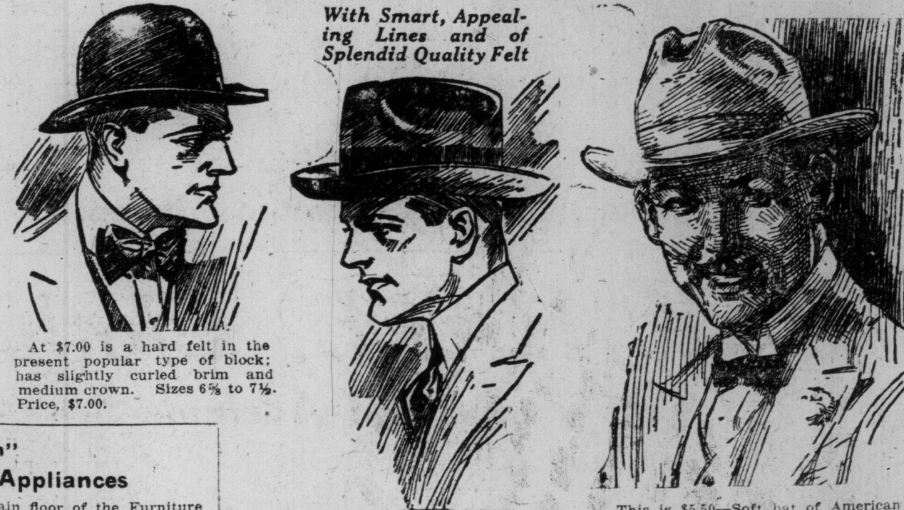
At $7.00 is a hard felt in the present popular type of block; has slightly curved brim and medium crown. Sizes 6 1/2 to 7 1/2. Price, $7.00.

With Smart, Appealing Lines and of Splendid Quality Felt