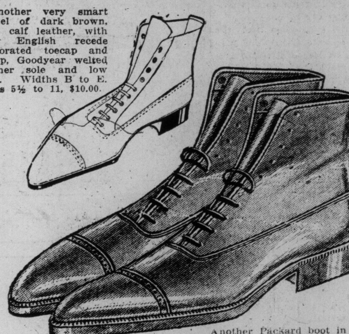
Another Packard boot in a rich brown shade of fine vicci kid, with long English recede toe, blind eyelets to top; leather sole, low heel. Widths A to D. Sizes 5 1/2 to 11. Price, $13.00.