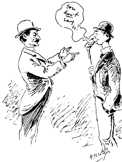
"STUFFING A GOOSE."