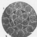
Locked Coil Aerial Cable or Colliery Guide.