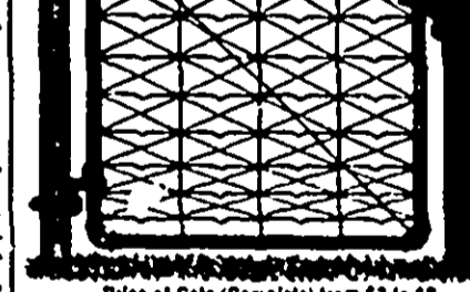
Price of Gate (Complete) from $3 to $8

1st.—It is made of the best material known for fencing, viz., extra hard steel wire. 2nd.—The horizontal wires are crimped every foot to allow for contraction in winter and expansion in summer; whilst frost and heat have always been so destructive to all other wire fences. 3rd.—The upright wires are composed of No. 14 Galvanized Annealed Wire; this is wound three (3) times around each horizontal wire alternately in opposite directions, thus making it absolutely impossible for the horizontal wires to sag or shift. 4th.—It will not injure your stock in the least. It is needless to mention instances in which valuable animals have lost their lives, while others have been nearly ruined, and thousands are scarred, by the barbarous Barbed wire fence. We claim that the object of a fence is, not for mutilation or destruction of live stock, but simply restraint. This our fence secures.