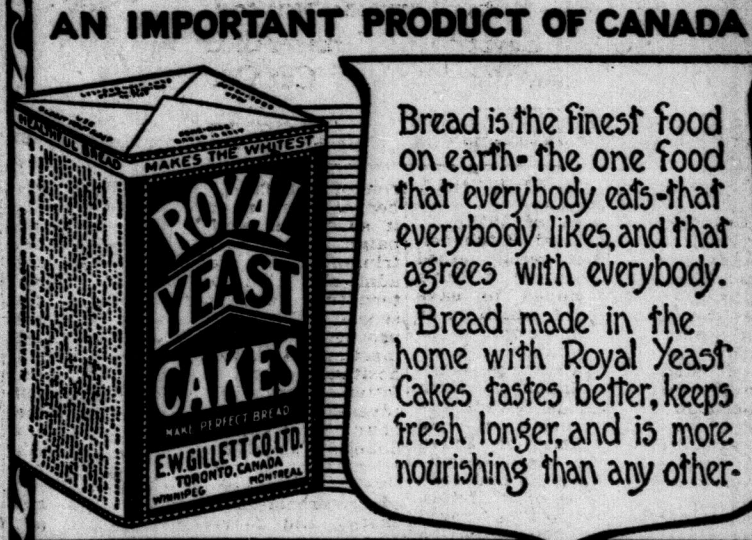
Bread is the finest food on earth—the one food that everybody eats—that everybody likes, and that agrees with everybody.