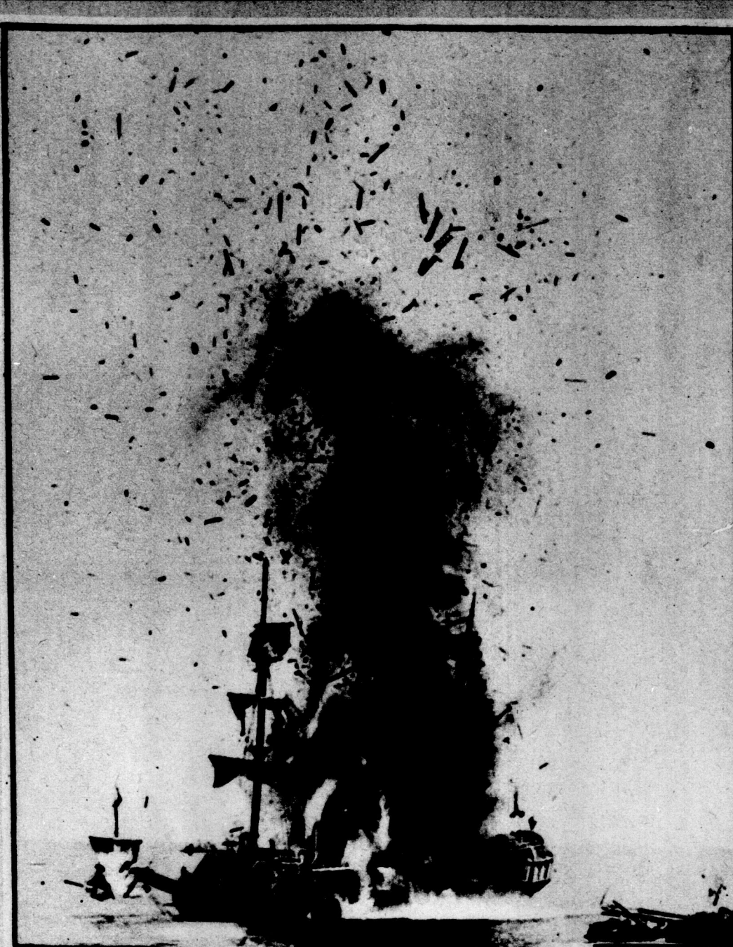
A pirate ship is blown to bits by Captain Blood—off the wild coast of Los Angeles