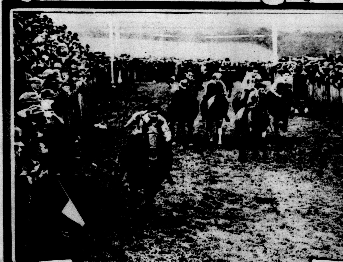
The pit boys ride their ponies in the annual pony derby at the coal mines of Wakefield, England