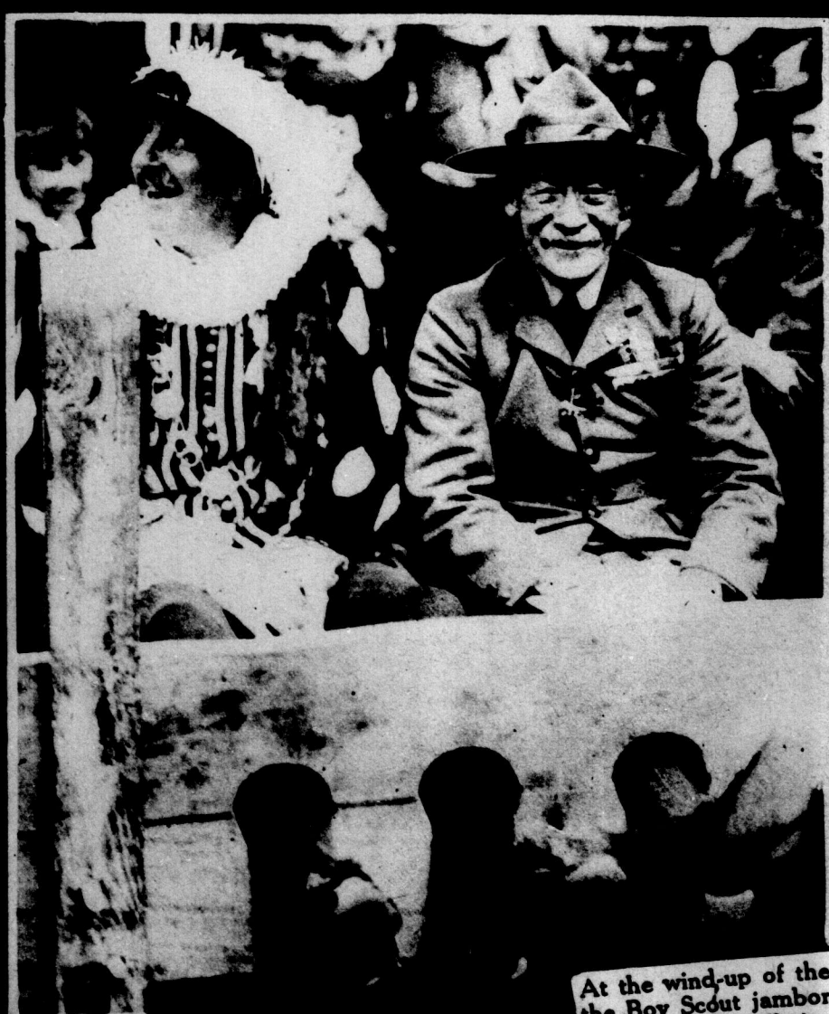
At the wind-up of the Elizabethan pageant at the Boy Scout jamboree at Wembley, Baden-Powell sits in the stocks