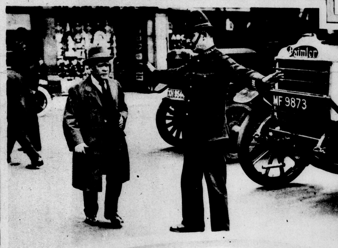
Stephen Walsh, British war minister, crosses the Strand