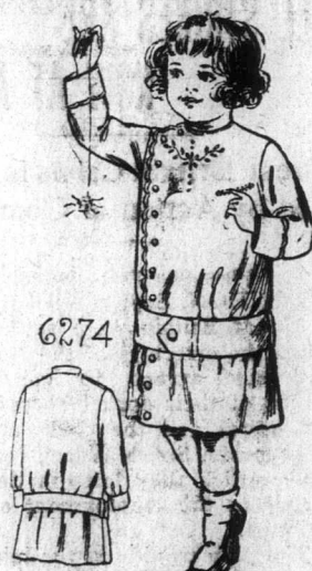
Boy's Russian Dress.

This pretty suit has an extra large arm hole and is made high in the neck, with the closing well over at one side. The belt is wide and flat. Such materials as linen, pique, poplin, pongee silk, as well as the simpler wash fabrics, gingham, percale, duck and the like, are used for these suits. The suit pattern, No. 6274, is cut in sizes 1, 2 and 3 years. Medium size requires 1 1/2 yards of 36 inch material. This pattern can be obtained by sending 10 cents to the office of this paper. Eight days must be allowed for receipt of pattern.