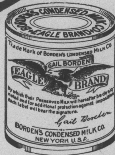
The Leading Brand Since 1857

These handsome brown and gold labelled tins will make a splendid display for your windows and cases. Get them before your trade now. Picnic and outing time is here.