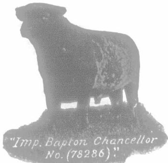
"Imp. Bapton Chancellor No. (78286)"