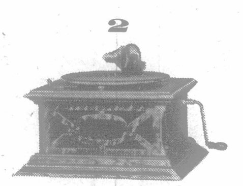
THE ECLIPSE, $32.50

The Climax has the famous Continuous Tone Chamber and Two-spring Silent Motor, and is in every way a complete and reliable musical instrument. It will last a lifetime and play any disc record of any make.