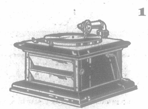
THE CLIMAX, $25.00 With These Double-Disc Records $37.30