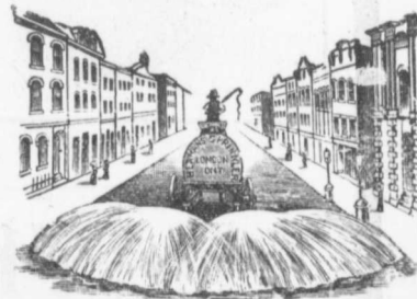
Studebaker Sprinkler (PATENT IMPROVED.)

Because no sweeper so effectually does the work for which it is designed as "The Studebaker." It sweeps Clean. No sweeper is constructed with the same degree of care and mechanical precision. It wears Well. "The Studebaker" has the smallest number of working parts, and has less gearing than any other sweeper made. It is free from all unnecessary complications. With a reasonable care it does not get out of order. Read for complete descriptive catalogue.