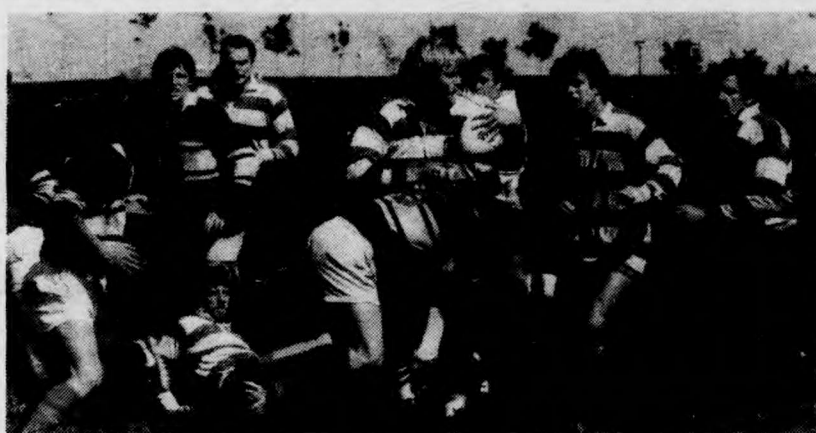
Bodies lunge and glide at last Saturday's game.