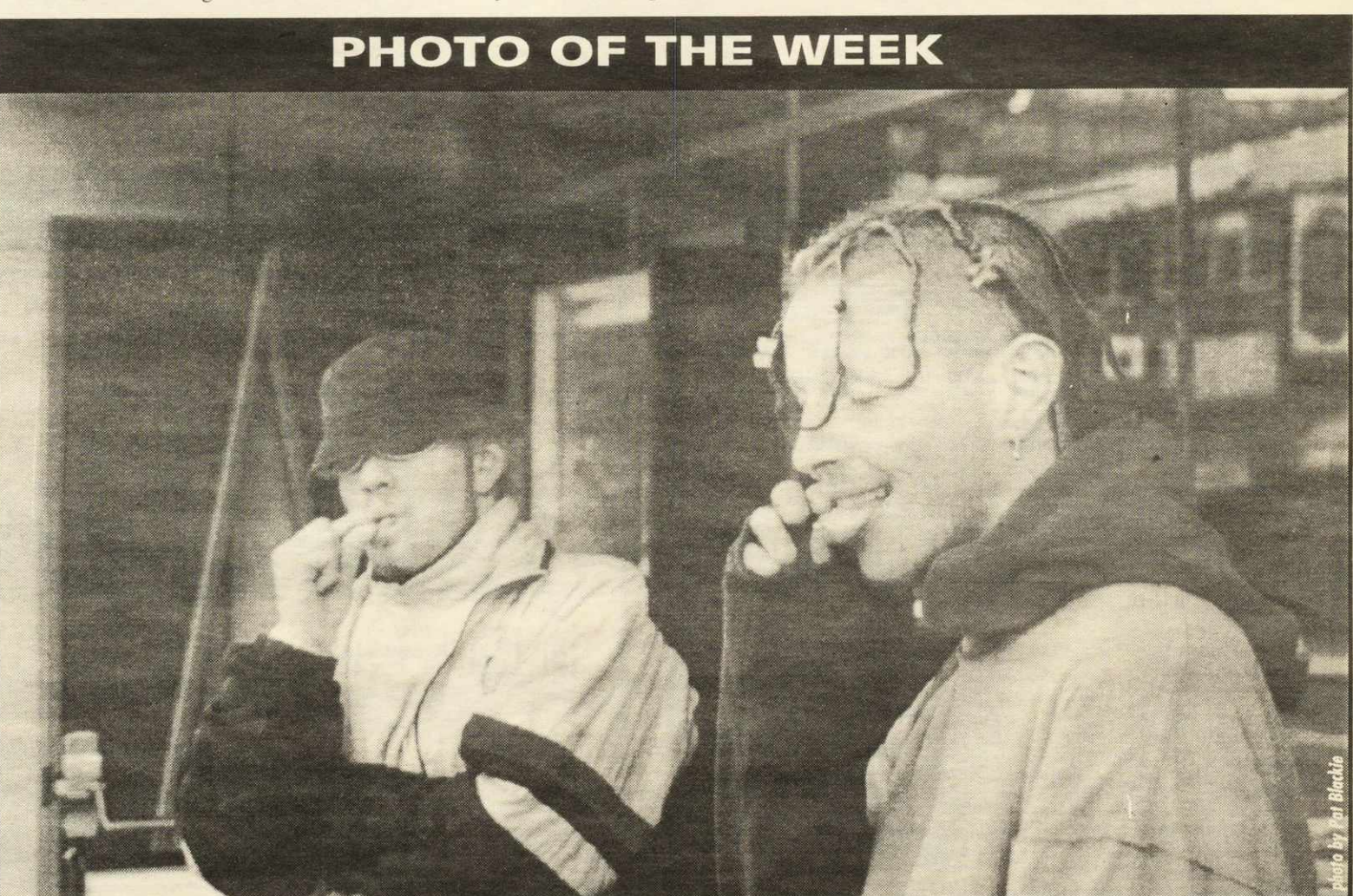
"Two dollars away from a gram, two dollars for some marijuana!"