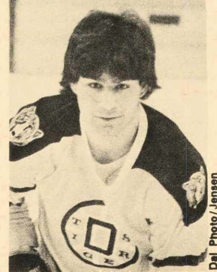
Tiger's scoring ace Ray Off