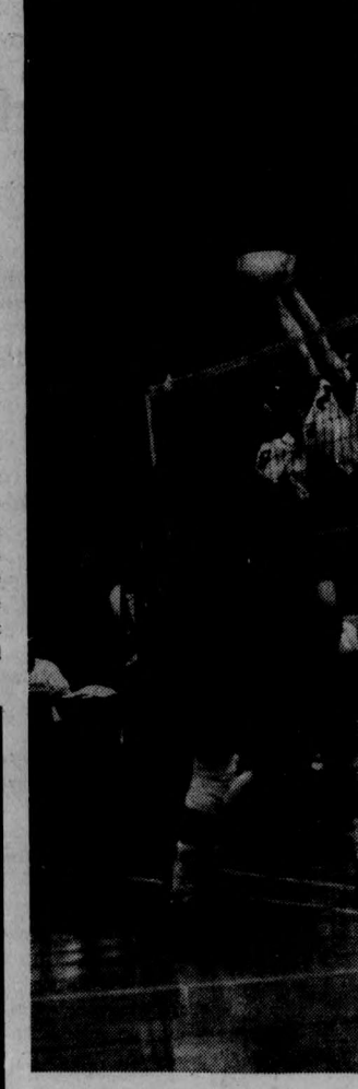
Two blockers rise during the UNB

action. The Reds will not have week of November when they will take on Saint Mary's. The V-Reds will be heading to Quebec for a tournament this weekend on Friday, Saturday and