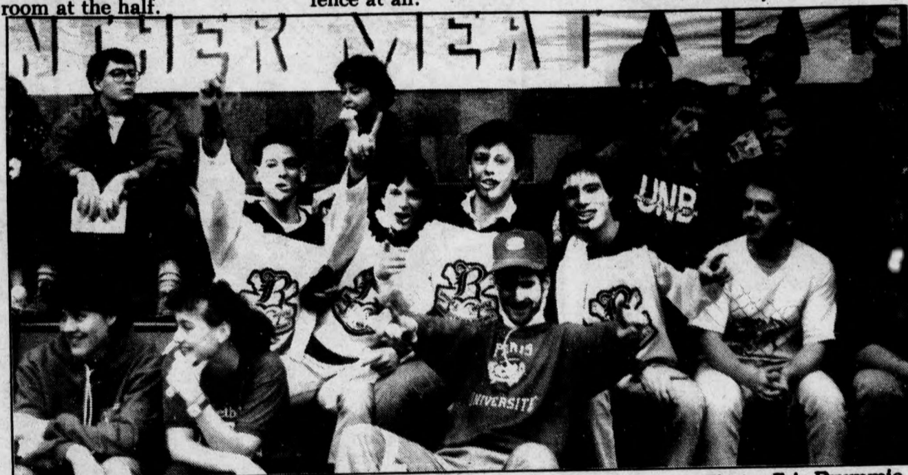
Bridges shows its support at Bloomers game.

The Bloomers have a pair of conference games on the road this weekend. Tomorrow they play St.FX, and they're in Halifax to play Dalhousie on Sunday in a game that will decide second place in the conference.