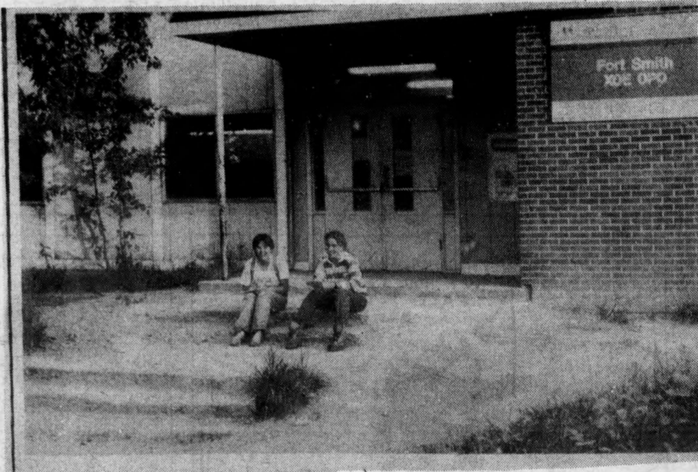
Canada Post made home feel closer than the actual 3600 km.