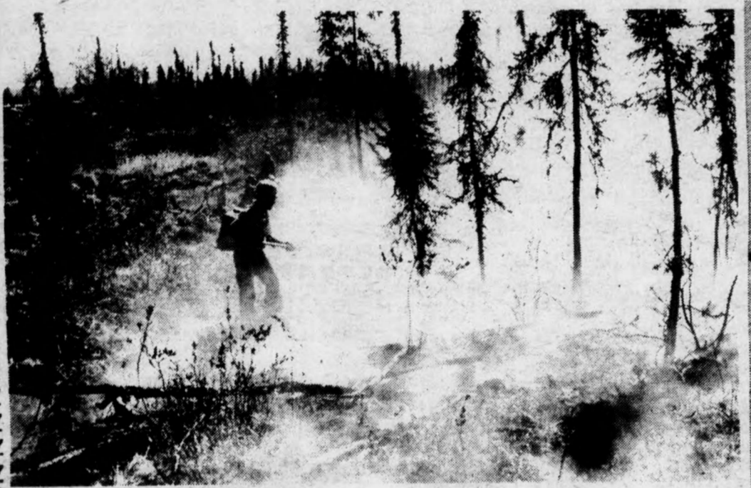
One of the conflicts in park management involves the degree of suppression required to maintain the park in perpetuity.