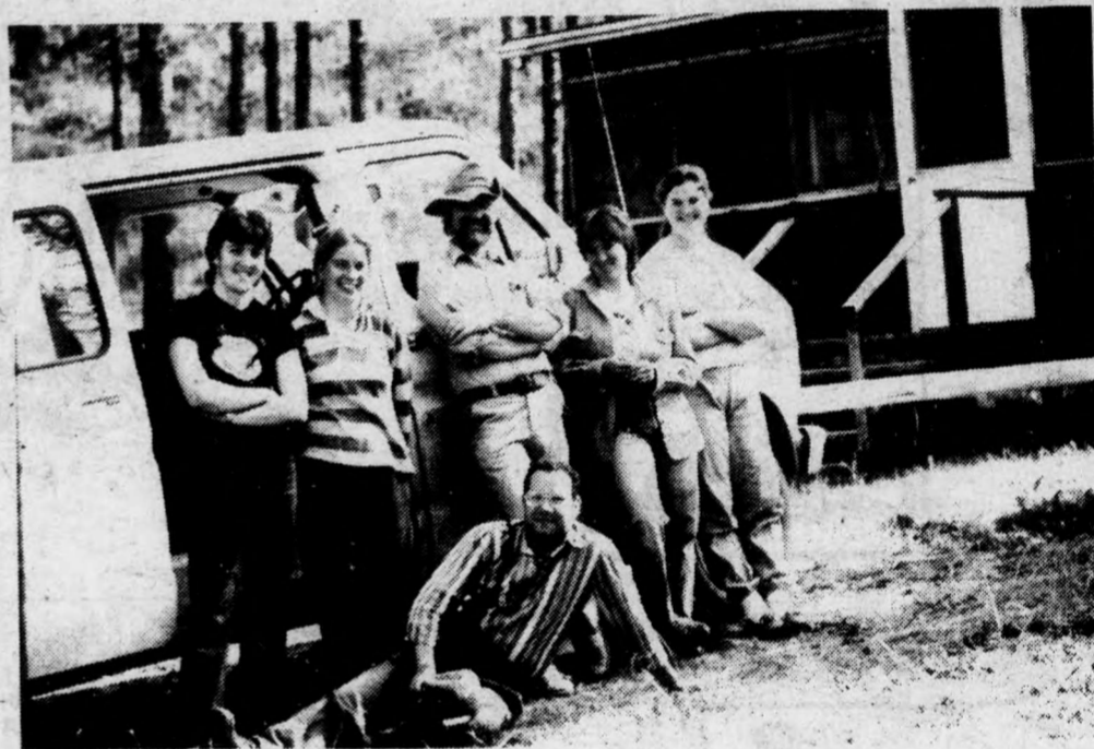
Our research team, poised at the beginning of the field season. (note the clean clothing)