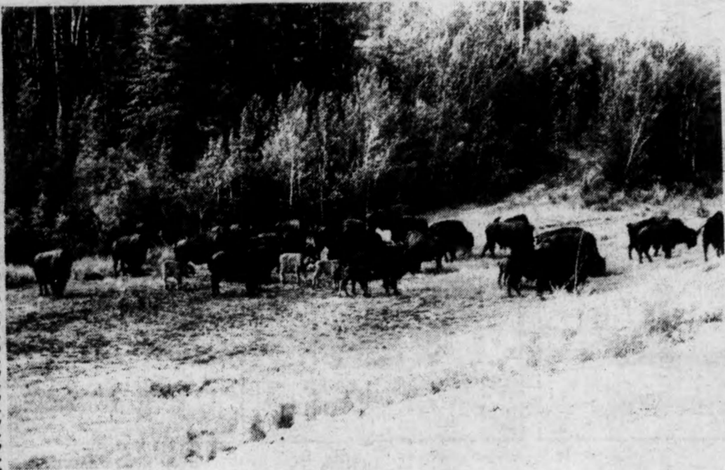
Since the bison is a rare species, it is valuable to know how fire affects them.