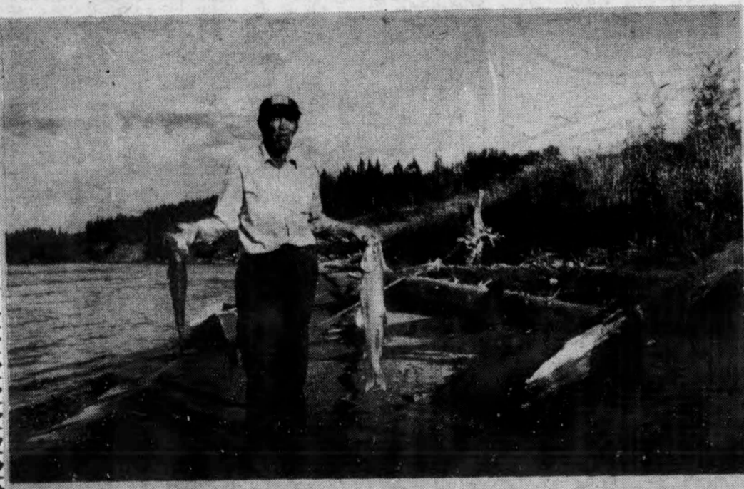
Almost half of the population of Fort Smith is native Métis and non-status Indian peoples, many of whom are tied to the land economically and socially.