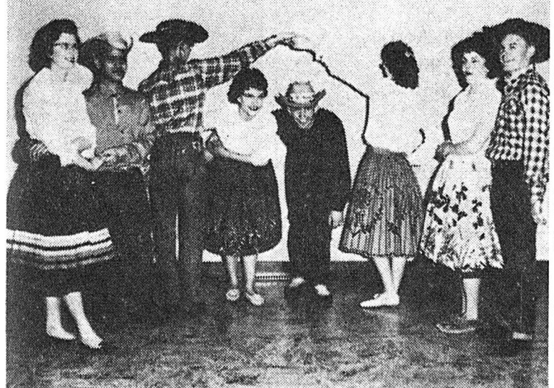
Wall I Reckon

Western dress is optional for this shoe dance. Prizes will be given for the best dressed cowboy and cowgirl. Chwyll Brothers Orchestra will lead the dancers through reels, polkas, 23-6 In Total Point Series