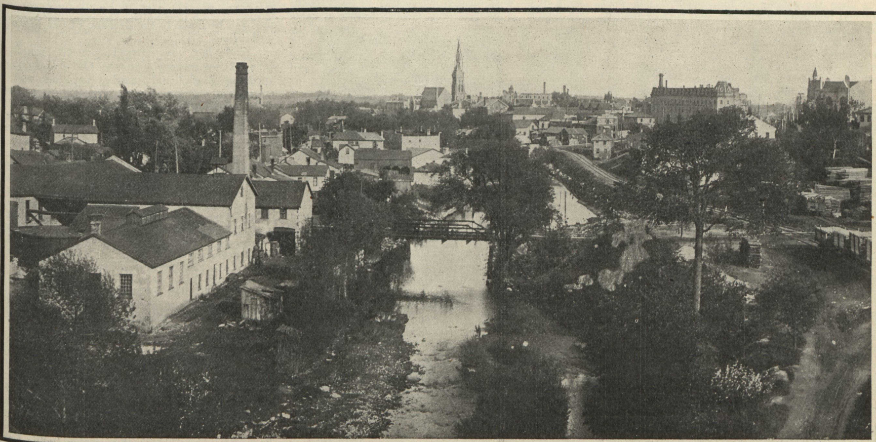
The City of Guelph, one of the best in Western Ontario. It contains the Ontario Agricultural College, and its greatest annual event is the "Fat Stock Show" held annually in December.