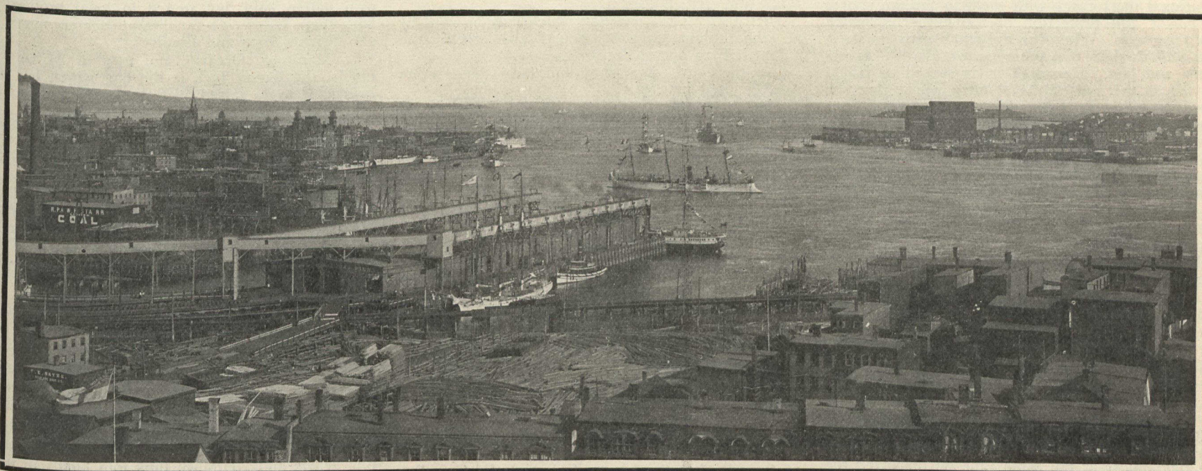
The Harbour of St. John, the Winter Port of Canada. The wharf and grain conveyors at the left are in the I.C.R. service. The elevators in the distance are in the C.P.R. service. On the extreme left is Courtenay Bay which the Dominion Government expects to dredge shortly. The Grand Trunk Pacific may ultimately find an ocean terminus here.