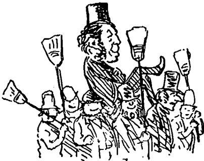
No. 7.—He was elected to the Local Legislature.