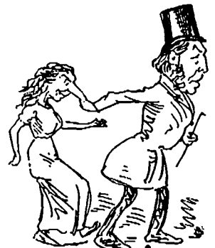
No. 9.—And led his province into Confederation.