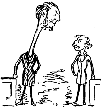
No. 10.—He afterwards distinguished himself in the Dominion Parliament.