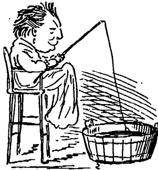
No. 2.—He early exhibited a love of his Province.