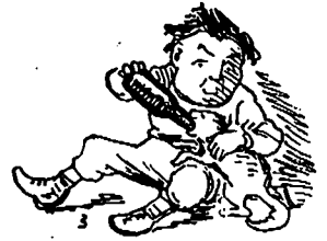
No. 3.—And a strong passion for the medical profession.