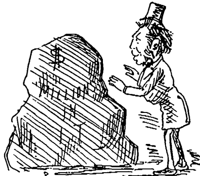
No. 8.—Where he discovered the Spring Hill coal mine.