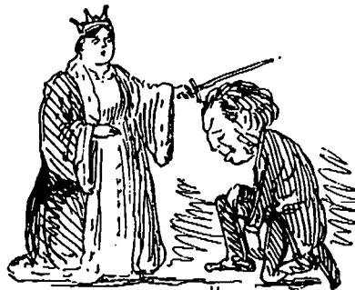
No. 11.—For which he was knighted.