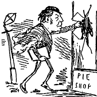
No. 4.—In due time he became a medical student.