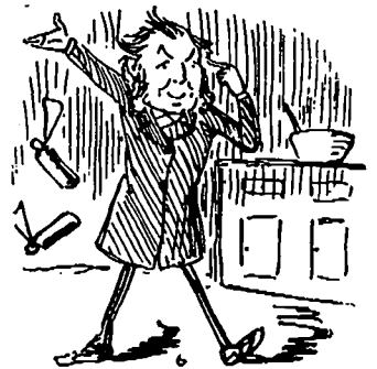
No. 6.—Then he began to study politics.