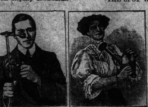
Catarrh, Cold in Head

which are given in every City visited by the VEEDEE DEMONSTRATORS for the purpose of publicly proving the power of the "Veedee Blood Circulator," Vibrator and Health Restorer (sometimes called a "Pulsator," but properly known only to distinguish it from would-be imitations,—by its Registered Trade Marked name, "The Veedee') to relieve without drugs or electricity the pain of poor tortured sufferers from Neuralgia, Rheumatism, Gout, Sciatica, Lumbago, and other painful complaints. They also demonstrate conclusively that a large number of cases of Functional Diseases, such a Paralysis, Deafness, Dyspepsia, St. Vitus's Dance, contractions from old wounds, Cramps, Constipation, Asthma, Bronchitis, Catarrh, Swollen Glands or Joints, Goitre, Tumours, and stiff or Contracted Muscles or Limbs, even in longstanding, chronic cases, can in many instances be either COMPLETE-LY CURED or greatly improved by the use of the "VEEDEE BLOOD CIRCULATOR," the curative value of which has been proved by tens of thousands of people from Royalty downwards.