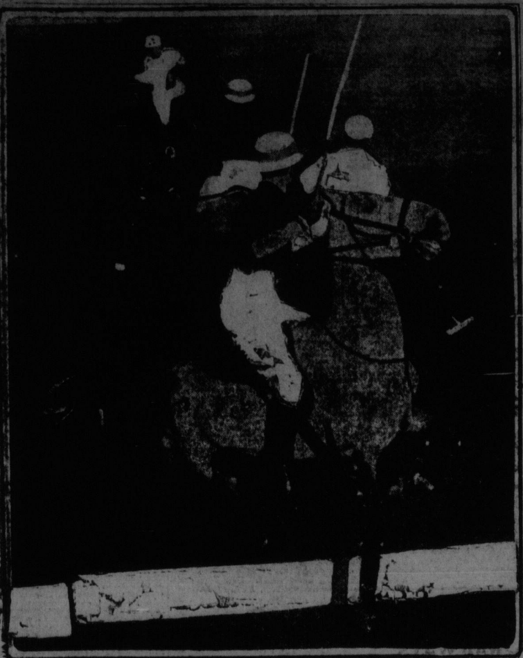
Brisk play near the side board. Captain Cheap of the Hurlingham team (English) in the foreground. The play in the first day's match showed the English poloists excelled the Meadowbrook (American) players, but the superiority of the American ponies gave the cup defenders sufficient advantage to win.