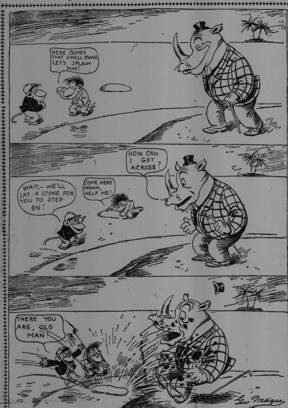
How the Monkeys Helped the Rhino Cross the Brook.