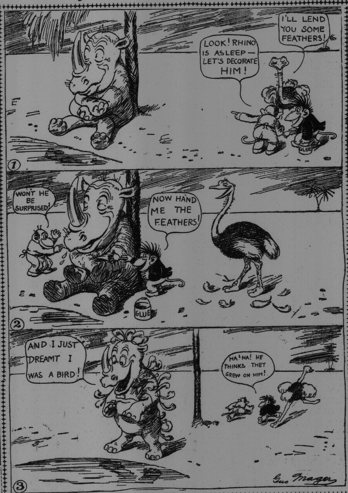
How the Monkeys Decorated Mr. Rhino.