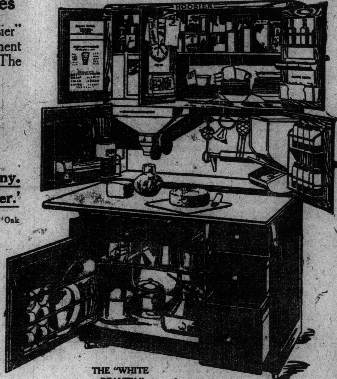
THE "WHITE BEAUTY"

Those who want to come in on this easy-way-to-get-one plan should enroll early. There is no formality or red tape whatsoever about joining the club. A payment of $1.00 down and agreement to pay $1.00 per week until cabinet is paid for covers every requirement. The cabinet will be delivered to your home as soon as the first payment is made, and you can begin to enjoy its comfort and help right away.