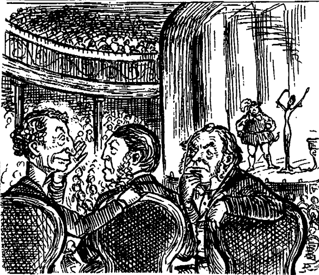
Cabinet Ministers in London witnessing the performance of Sara Bernhardt. TUPPER.—Dreadfully thin, isn't she? SIR JOHN.—Yes; but not half as thin as our excuse for being abroad.