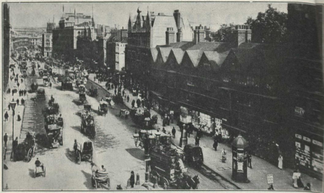
Holborn, one of the main thoroughfares of London, being a continuation of Oxford street to the city. The famous old houses in front of Staple Inn, now preserved in their original shape, are seen to the right of this view, looking eastwards.