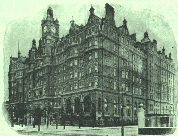
"A Temple of Luxury."

Adjoining the Terminus of the Great Central Railway. On direct route by Express Corridor Trains with the Midlands, Dukeries and the North.