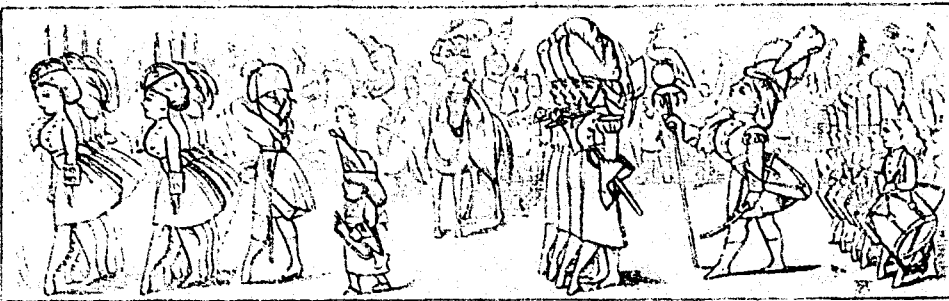
THE MARCH PART.—PLEASE DROP YOUR EYE ON THE DRUM-MAJOR AND THE LITTLE TOOTSY-FOOTRIES WITH THE DRUMS