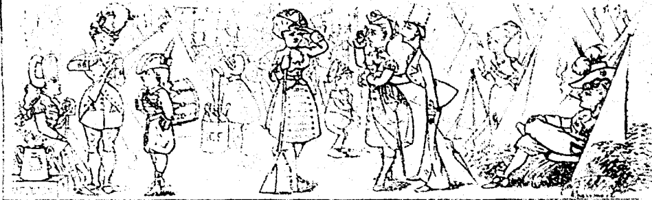
LOVE IN THE CAMP.—THE CAPTAIN BRINGS HER YOUNG MAN ROUND. HE FEELS TIMID.