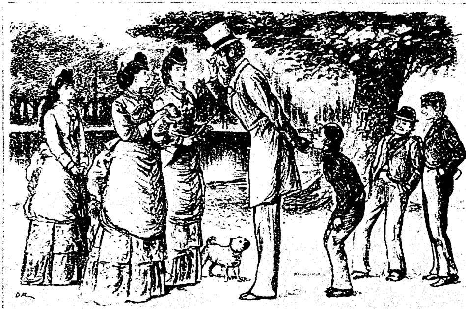
A SURREPTITIOUS WHIFF.