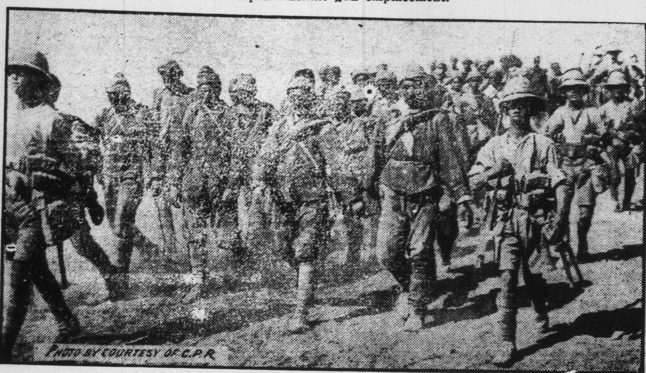
Turkish prisoners recently captured.