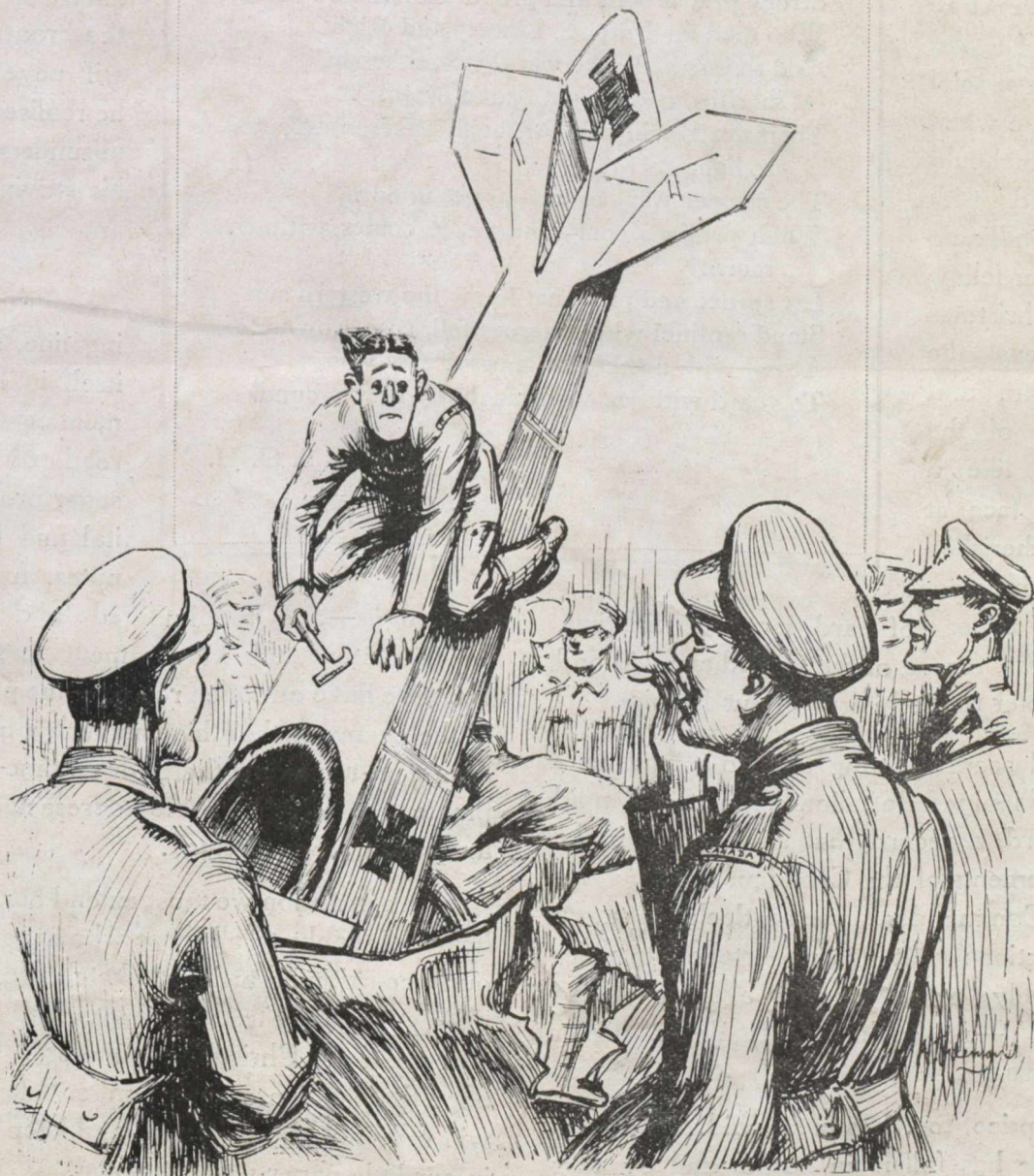
PLUCKING A FRITZ.

Souvenir hunter to R.F.C. mechanic, dismantling German plane: "Say, Bill, you keep the wings: just throw us the wishbone."