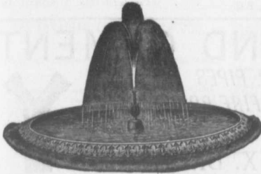
Design No. 1007.

Very Neat and Artistic For Man and Beast.