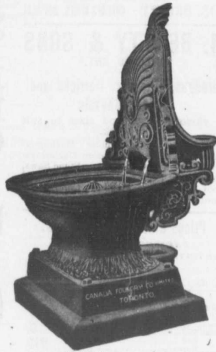
Design No. 1010.

Very Neat and Artistic For Man and Beast.