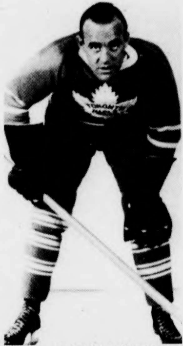
The immortal King Clancy

Maple Leafs Trivia Book, it should prove to be a valuable collector's item for any devout Leaf fan. By the way, the answer to the trivia question is Larry Hillman.