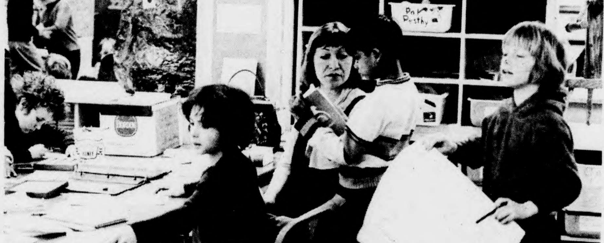
Students and teachers learning at the Faculty of Education.

For information regarding the B.Ed degree program contact the Office of Student Programmes at 667-6305, Rm. N802 Ross.