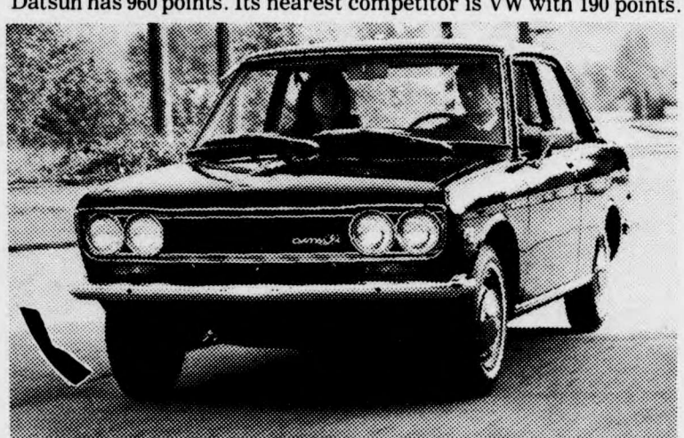
"THE RALLY WINNING DATSUN 1600"

Datsun looks to have the National Rally championship in the bag this year, a repeat of the last three years. In the '69 series consisting of 24 events in which five Datsuns finished in the top ten in all 24, an incredible performance considering all of them were privately owned. To help offset the costs of participating (this is a tough series), the Nissan Automobile Co. (Canada) manufacturer of Datsun cars and trucks offers $10.00 per point earned in the National Championships and $250.00 to the entrant gaining most points in each region (west coast to Atlantic). So far this year Datsun has 960 points. Its nearest competitor is VW with 190 points.