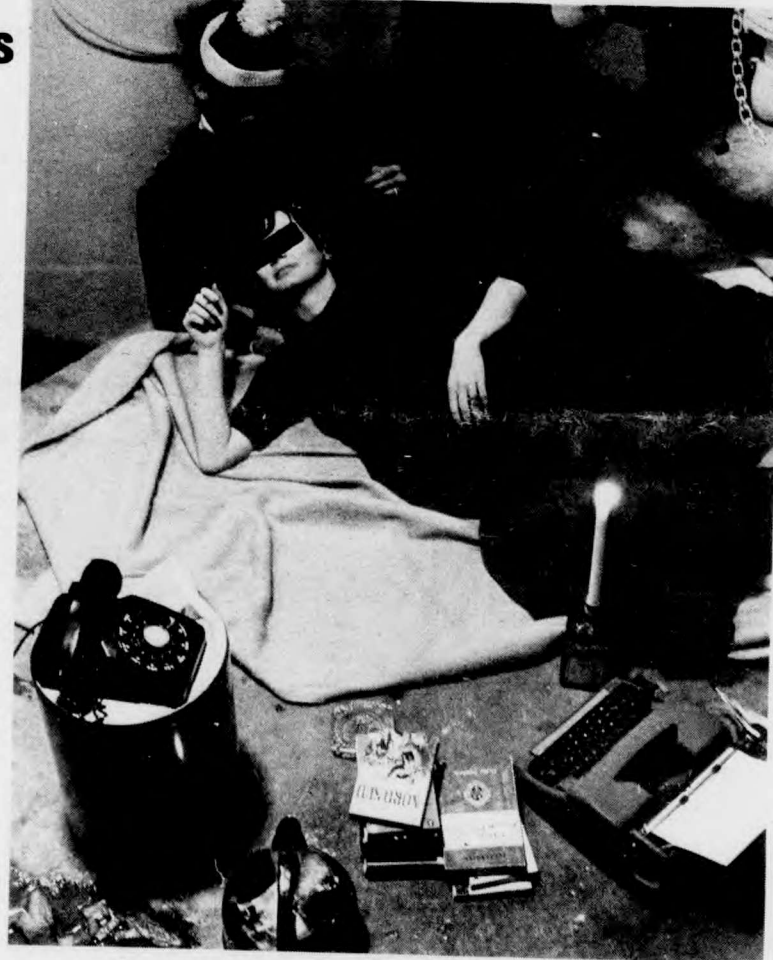
Tunnels are fun, and cheaper than residence, too.