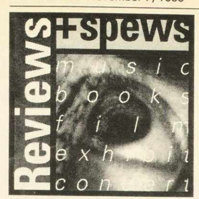
Age and Guile Beat Youth, Innocence, and a Bad Haircut by P.J. O'Rourke Vintage Canada