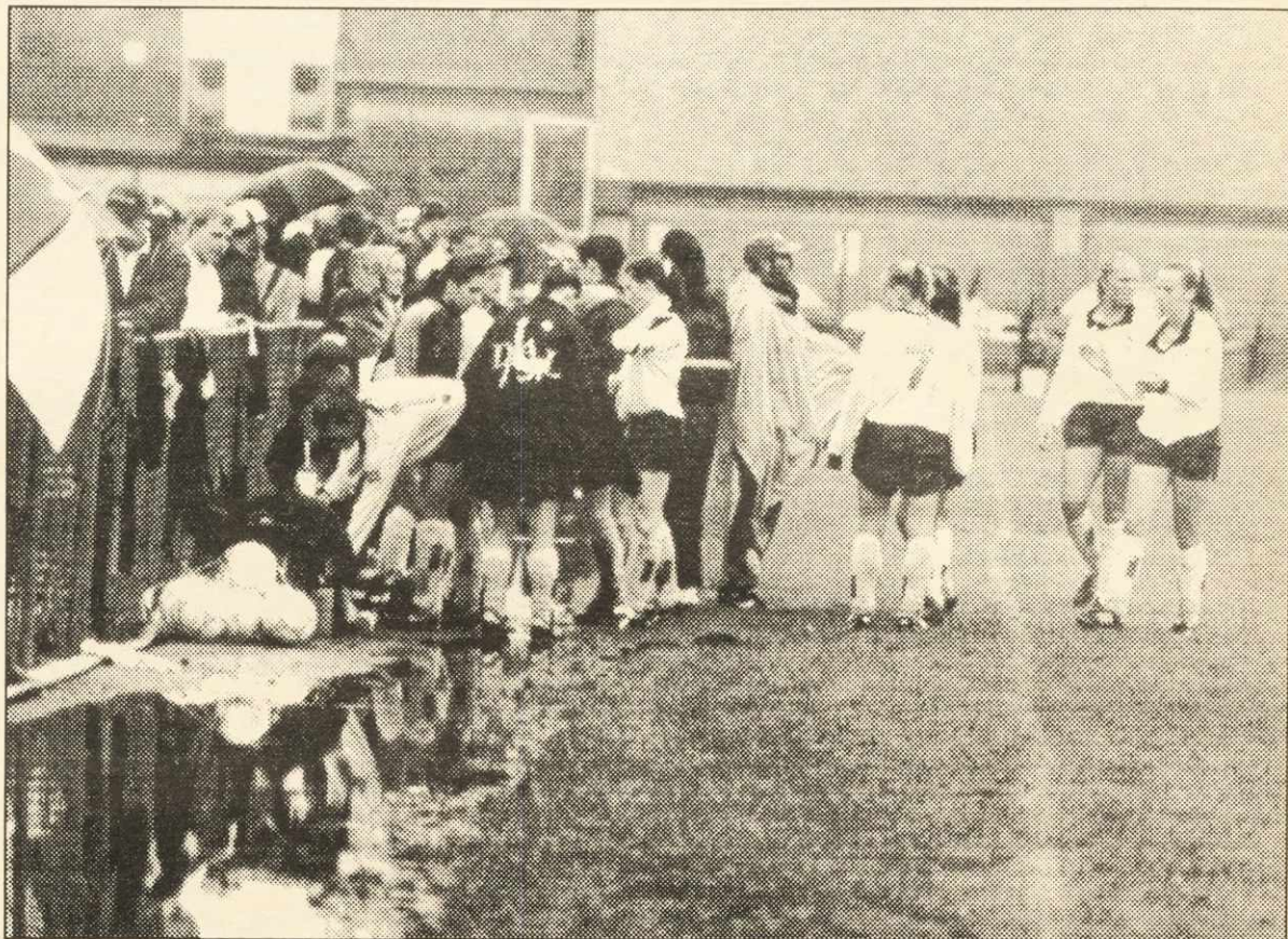
Studley field had grown a moat by the time the game was over