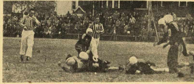
Unidentified Dal ball carrier stopped after big gain.

as they are the only team with three straight wins, but there is still one more game to play with