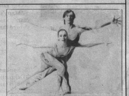
NOVEMBER 7 & 8 at 8 p.m. SUB Theatre